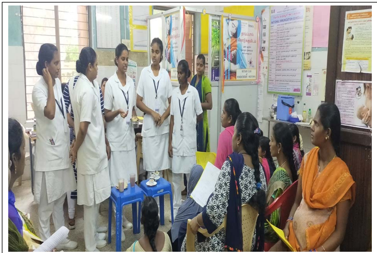
Health education on anemic diet