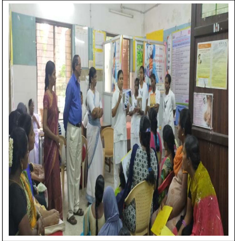
Health education on Antenatal care