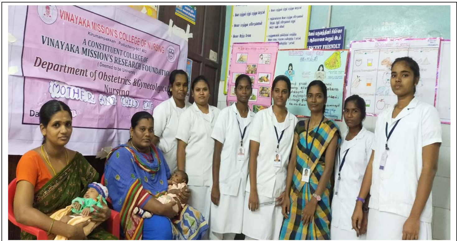
Poster presentation on Temporary and permanent contraceptives