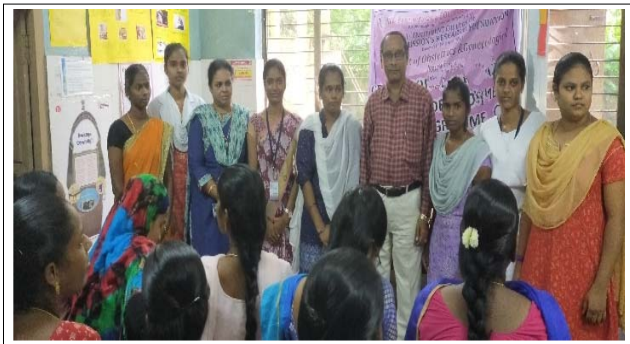
Role play on Antenatal mother and child health: Medical officer, Health inspector, counsellor and Auxiliary Nurse midwives were participated in role play and appreciated the students.